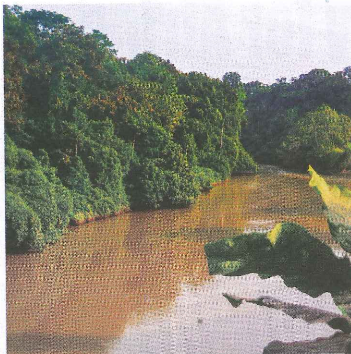
Gabon's Ogooué River, the lifeline of the country and the subject of several joint research projects by the GOC on river and fisheries, health and conservation.