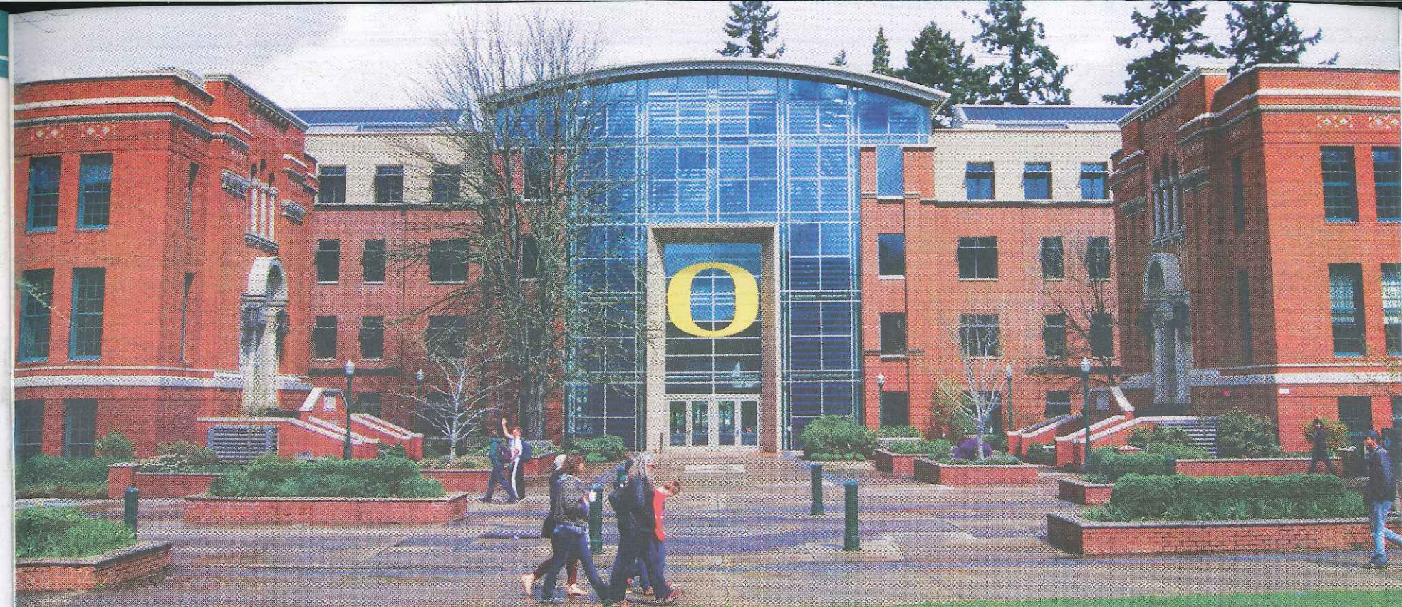
The University of Oregon in Eugene