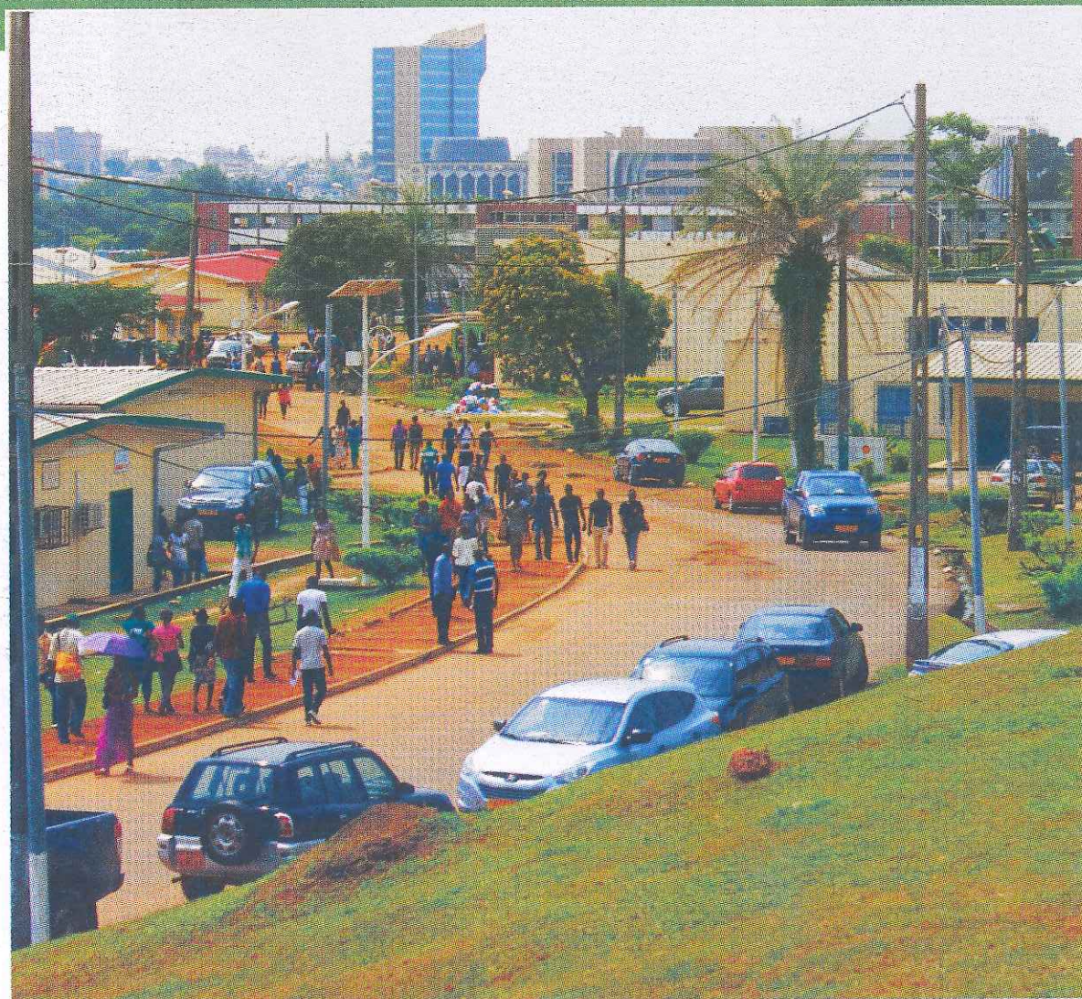
The Central Campus of Gabon's Omar Bongo University, the site of the Gabon-Oregon Center's flagship project on sustainable renovation of the university.

Simply referred to as the Gabon-Oregon Center (GOC), the University of Oregon's Gabon-Oregon Transnational Research Center on Environment and Development was established in March 2013 with the primary purpose of developing collaborative research and public outreach partnerships between the U.S. state of Oregon and the Republic of Gabon.