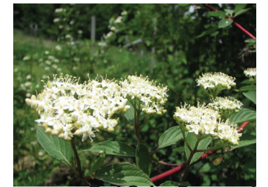
Red Osier Dogwood