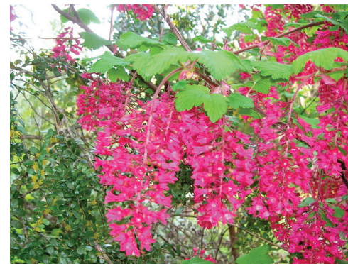
Flowering Red Currant