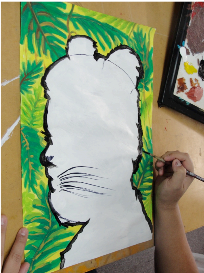
Step 4: Outline the silhouette