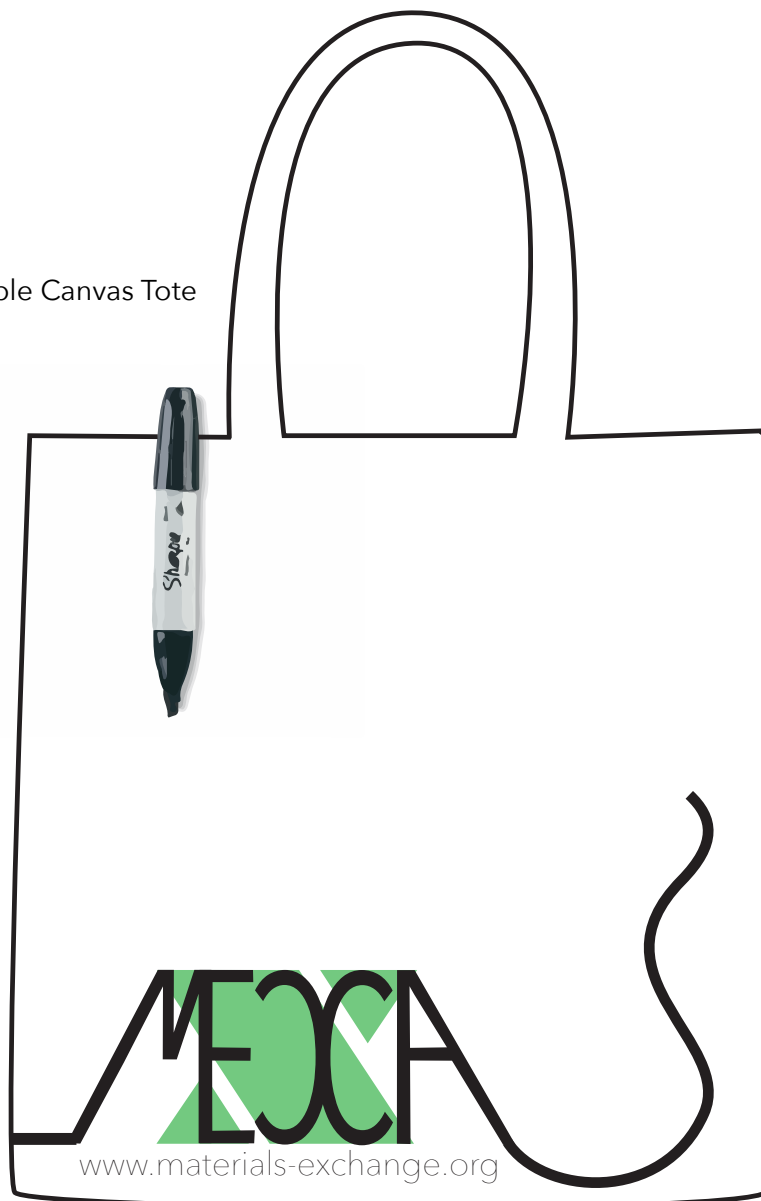
Re-useable Canvas Tote

This is the collateral design example for a re-useable canvas tote. The organic playful line extending from the letter A in MECCA invites the artist to complete the image by using his or her imagination to add a custom drawing.