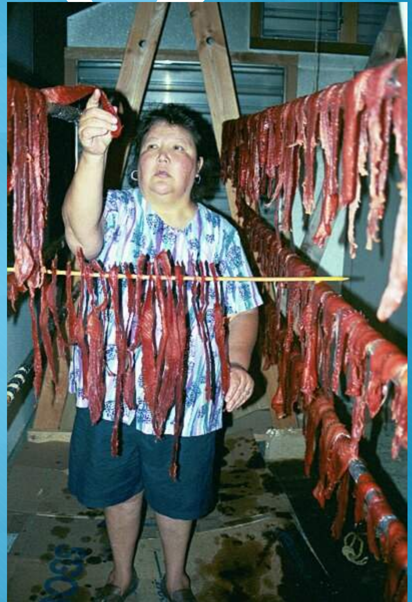
Continued tradition of drying salmon-yesterday and today.