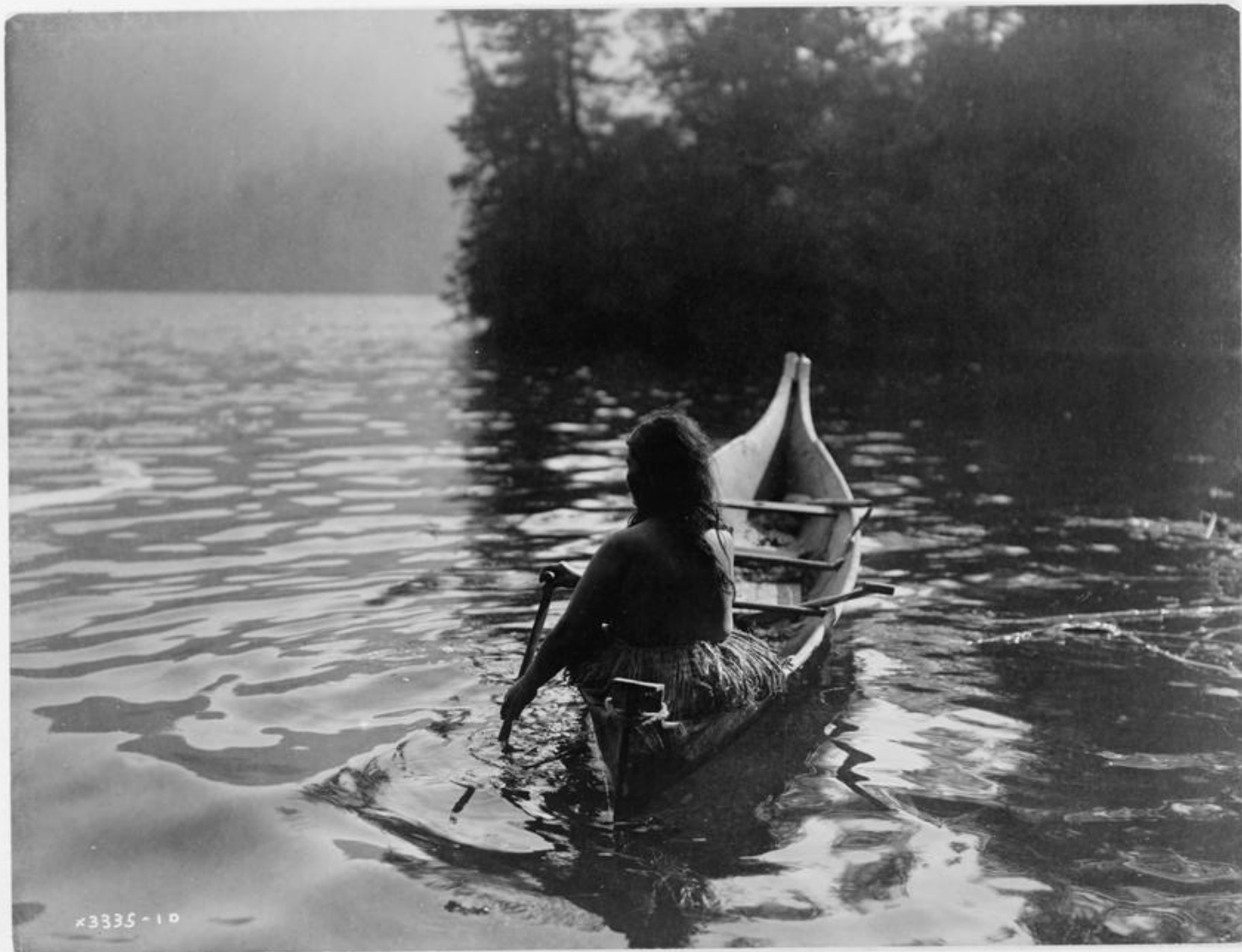
Title: Into the shadow—Clayoquot (Curtis, 1910b)