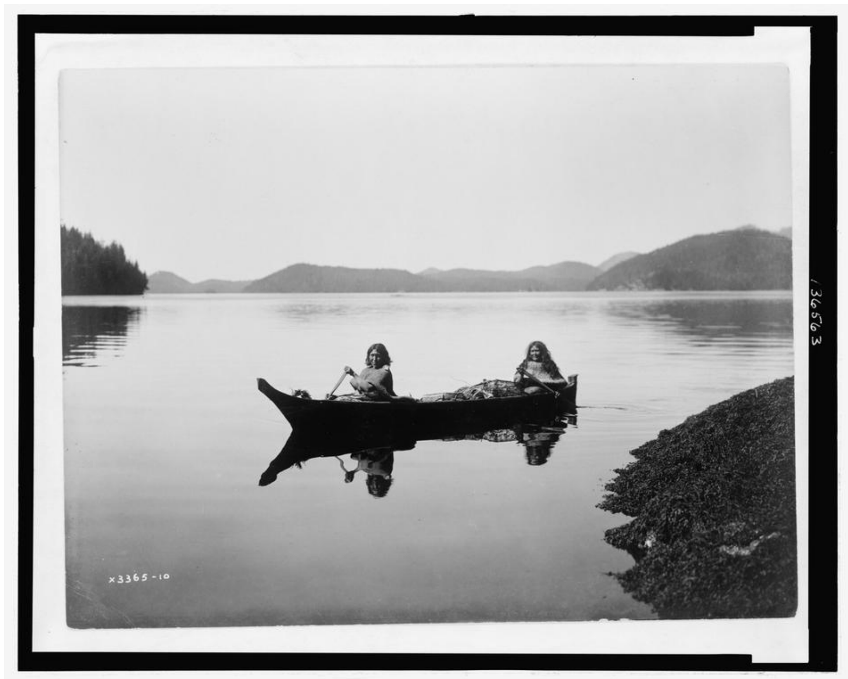
Title: Canoeing on Clayoquot Sound (Curtis, 1910c).