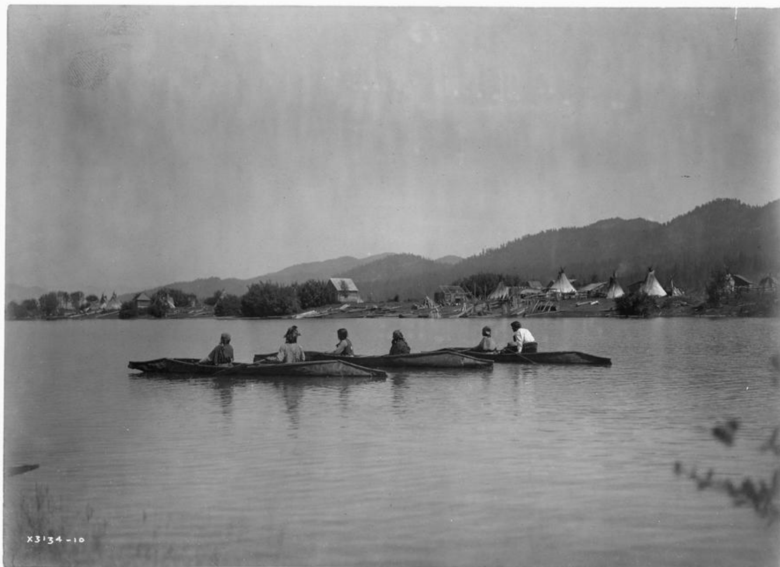
Title: Home of the Kalispel: Kalispel camp on a riverbank with tipis and frame houses, three canoes in water in foreground (Curtis, 1910a).