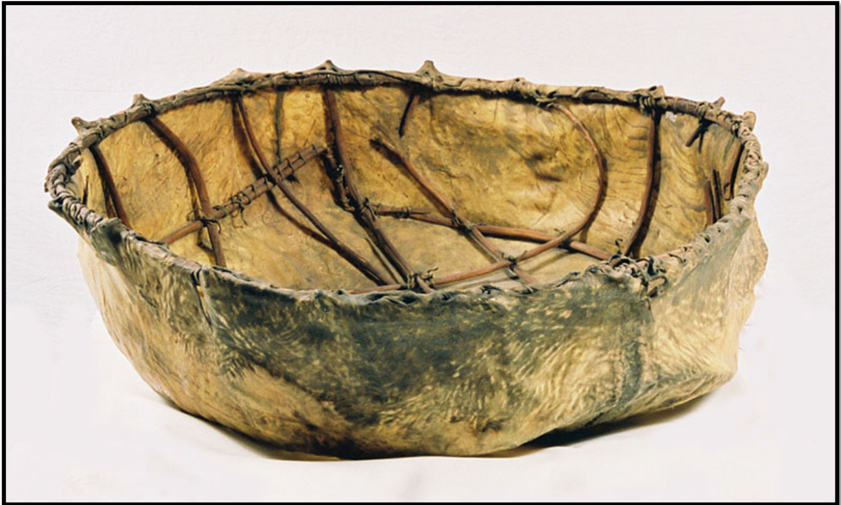
Title: Bullboat, 1860. Native peoples along the upper Missouri made small boats like this to travel along the shoreline, carrying wood and other supplies. Formed by stretching animal hides over a supple wood frame, bullboats were typically made by women. French, British, and American fur traders also used bullboats to bring their furs down the Missouri (Bullboat, 1860).