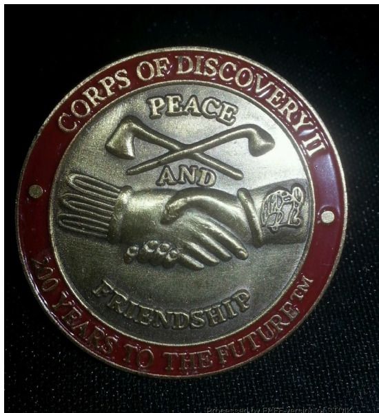
Logo/Pin of the "Corps of Discovery II: 200 years to the Future."

We see students becoming the bridge-builders of the future as they recognize the importance of relationship-building between Tribal and non-Tribal peoples and have ideas of how to go about forming relationships. We want students to understand the strength that comes from considering multiple perspectives on a particular place over time—from past to present and carrying forward into the future. We want students to have the capacity to give back to their home communities as