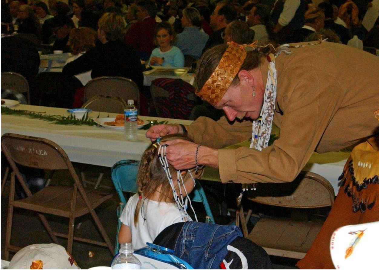
The "Giveaway" at a Northwest potlatch.

Curriculum (Teachings) and Pedagogy. Central to the Honoring Tribal Legacies project are seven featured curriculum units (teachings) located at: