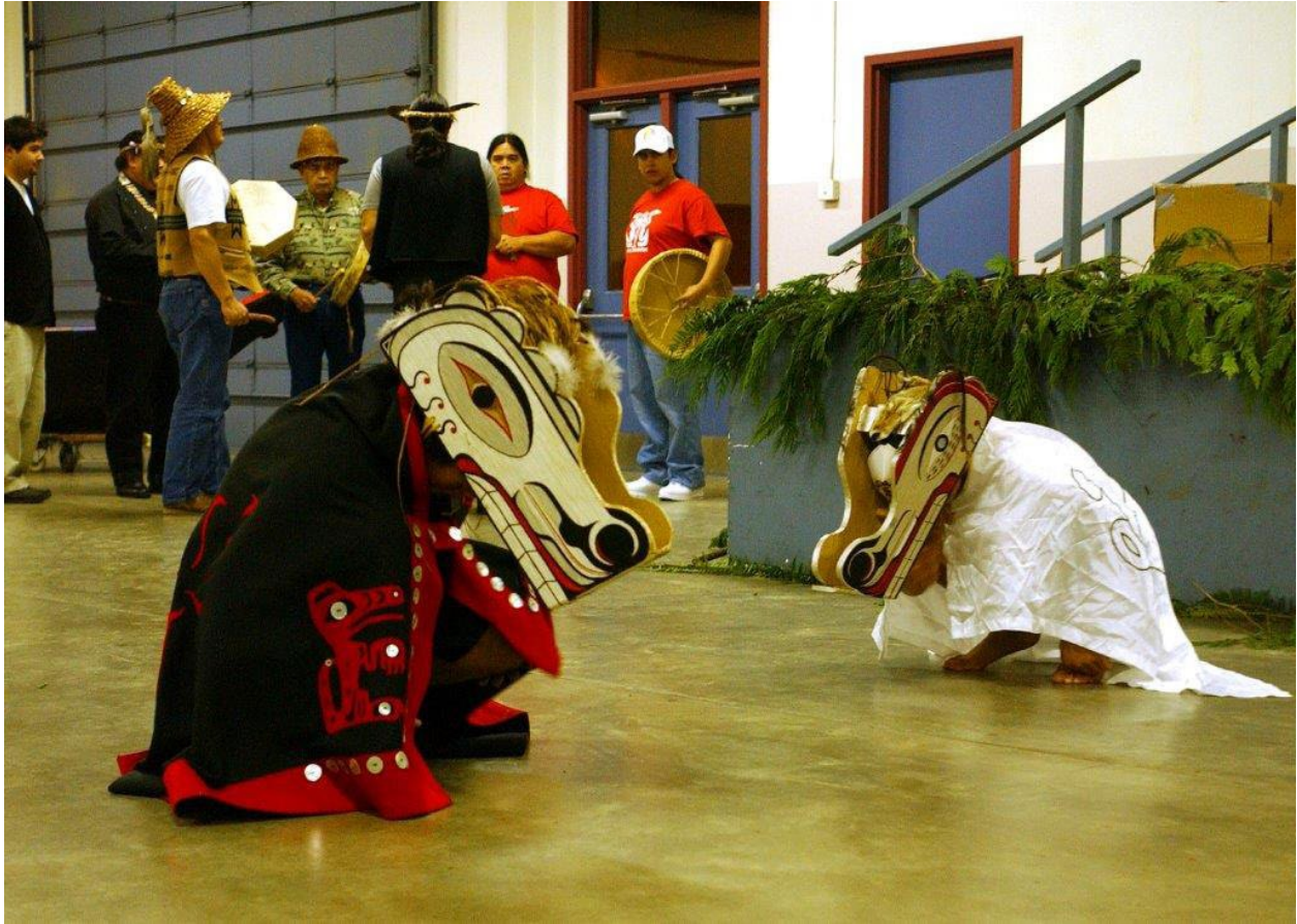
Clatsop-Nehalem potlatch honoring a new cedar canoe with Tribal and non-Tribal guests from across the Lewis and Clark Trail.