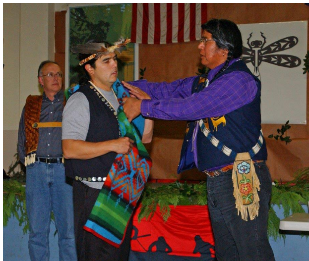
Warm Springs/Paiute elder honoring Quinault traditional carver at potlatch.

The Commemoration of the Lewis and Clark Bicentennial (2003–2006) fundamentally shifted the way in which the story of the Corps of Discovery was being told. As highlighted in the featured teaching (curriculum unit), Tribal Legacies of Pathfinding : critical pieces of information and support were shared by American Indian people with Lewis and Clark which enabled them to successfully traverse the North American continent in 1804–1806.