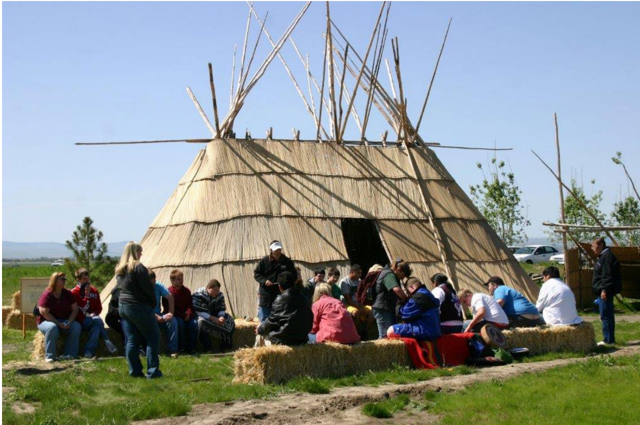
Traditional Longhouse of the Western Plateau Tribes.

Teachers. Carrying forward the legacy of the Lewis and Clark Bicentennial, teachers today can play a role as leaders of bridge-building across cultures. Teachers working with school leaders, including superintendents, principals, and school board members, can show respect for Tribal Sovereignty by forming relationships with their neighboring Tribes starting at the level of Tribal governments, as advocated by Washington state’s RCW 28A.345.070—House Bill 1495 (2005). Protocol and a toolkit for respecting Tribal Sovereignty in relationship-building have been developed by the Washington State School Directors’ Association (2010). The toolkit includes samples of: (a) a school board letter to Tribal leaders, (b) a school board resolution regarding Tribal history curricula, (c) a Memorandum of Agreement, and (d) a policy/procedure regarding curriculum development/instructional materials.