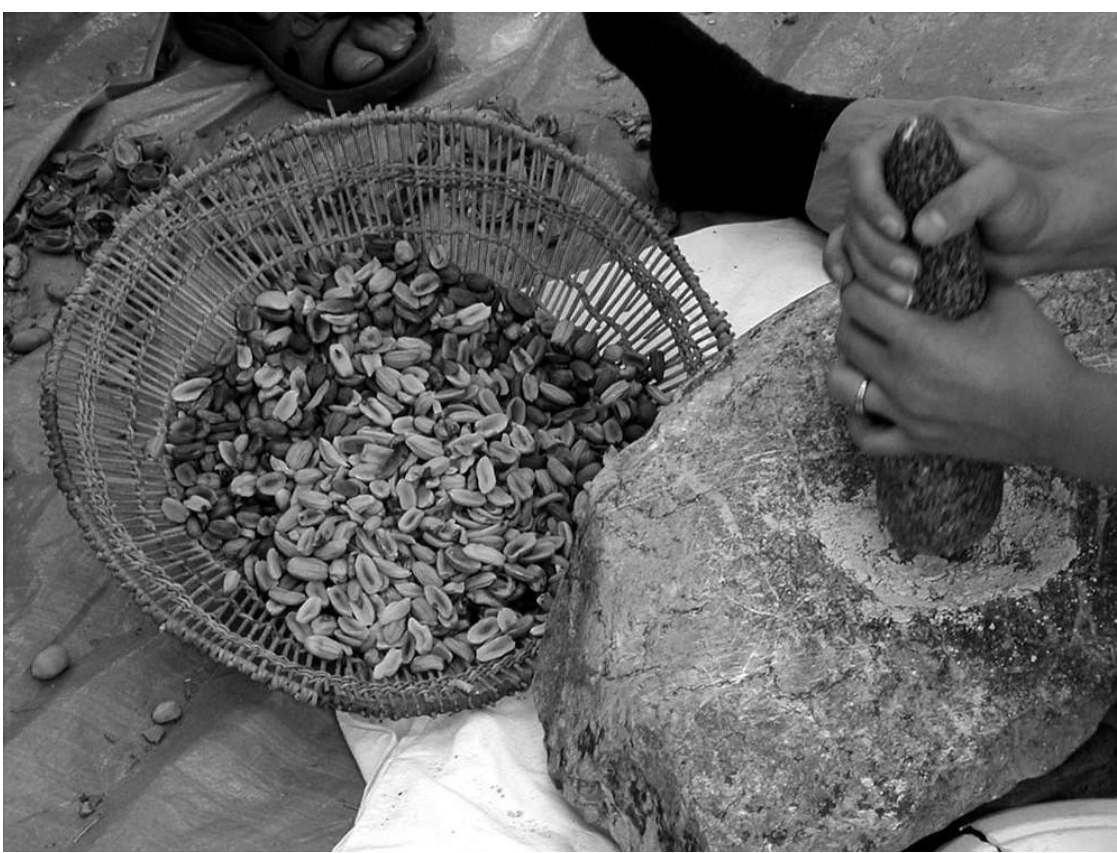
Figure 2.1 Grinding acorns