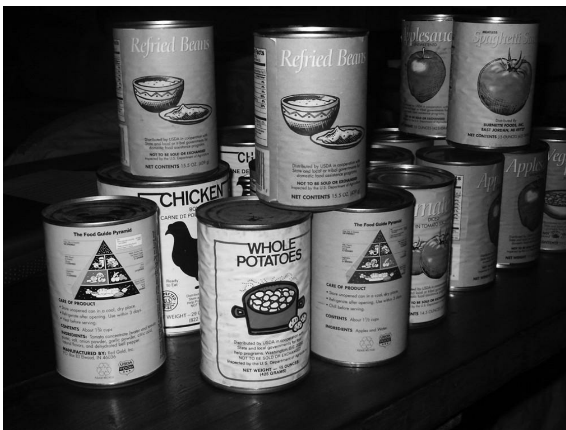
Figure 2.3 Commodity canned foods

Whereas long-standing cultural traditions existed for regulating and sharing fish and other resources both within the Karuk Tribe and between neighboring tribes, the entry of non-Indian groups into the region led to conflict and dramatic resource depletion (McEvoy 1986). As noted earlier, cultural management practices used to enhance food resources from burning to fishing have been made illegal by federal, state, and other agencies. For example, Europeans did not understand the role of fire in the forest ecosystem. Since the Gold Rush period, Karuk people have been forcibly prevented from setting fires needed to manage the forest, prolong spring runoff, and create proper growing conditions for acorns and other foods (Margolin 1993; Anderson 2005). For many years following white settlement in their territory Karuk people were simply shot for engaging in cultural practices such as setting fires. Non-Indian fishing regulations, such as those developed and enforced through California Department of Fish and Game, have often failed to take into account the Karuk as original inhabitants, their inalienable right to subsistence harvesting, and the sustainable nature of Karuk harvests. As a result they have attempted to balance the subsistence needs of Karuk people with recreational desires of non-Indians from outside the area. Karuk tribal member Vera Davis notes the imbalance and injustice of this view: