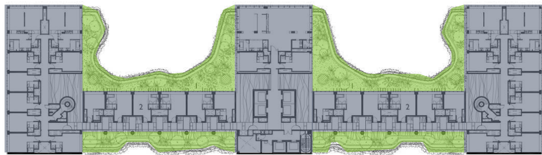
(ABOVE) Plan diagram showing skygardens and hotel rooms.

The 12 story building has an E-shaped plan. It was designed this way so that all guest rooms overlook the park to the north and/or into the sky gardens. The shape of the building and projecting sky gardens allows the building to be 'self-shaded.' This allowed the hotel rooms to be fully glazed without the need for external screening devices.