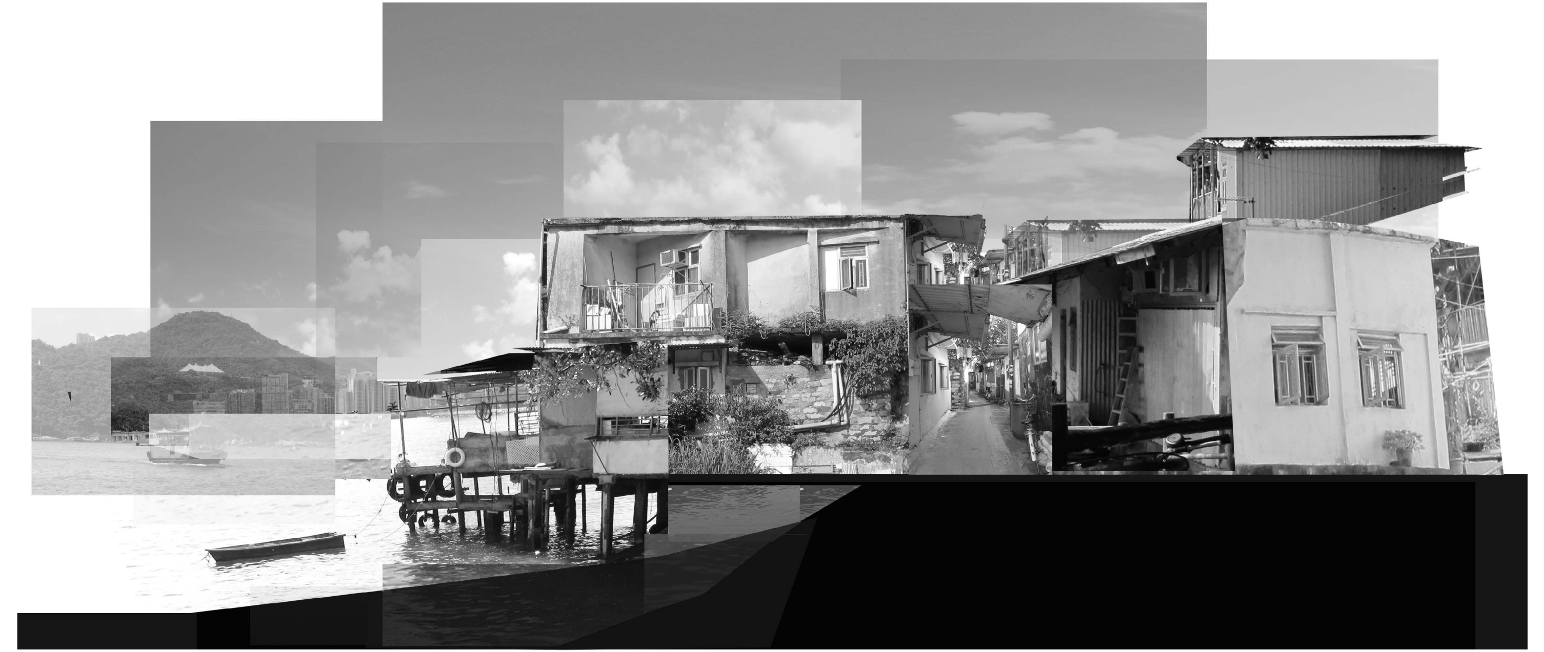
pedestrians & bicycles b1 10 0 10 20 30 b2