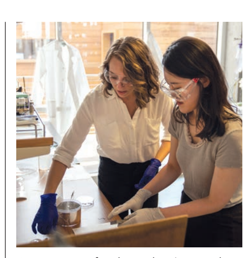
Oregon Center for Electrochemistry students performing research.

"This synergy between education, research, and innovation is allowing us to attack bigger and more important research problems than we have in the past" says Boettcher. "It was a grassroots effort to get this going, but things are starting to come to fruition because now we have connections in industry, and we're much more integrated into the research infrastructure in the US because