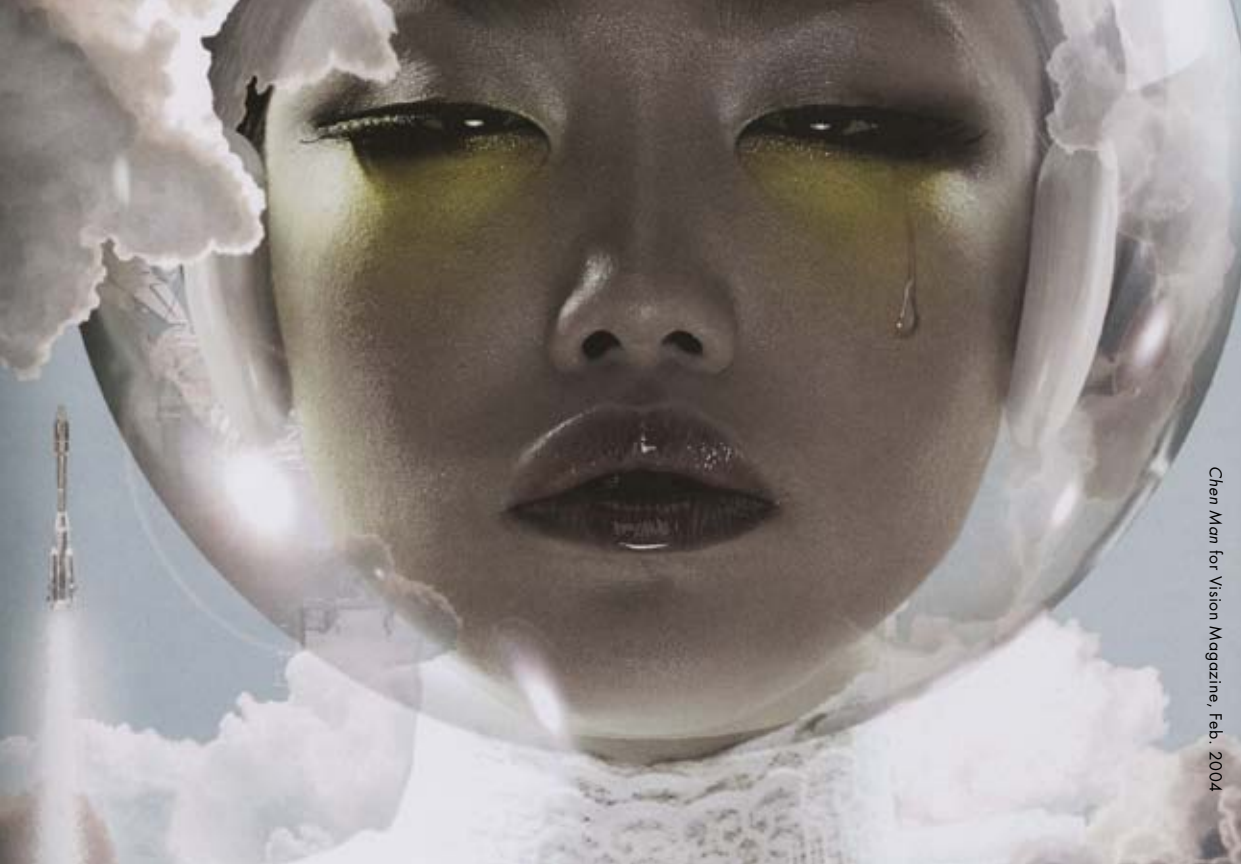
Chen Man for Vision Magazine, Feb. 2004