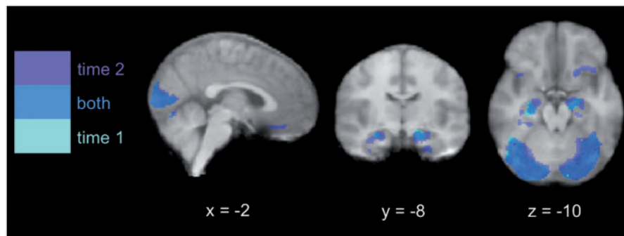
Fig. 2 Correlations between neural activity and pubertal development. Figure 2 depicts activity in extrastriate cortex, amygdala, and hippocampus that correlates with pubertal development at T1 and T2. x , y and z refer to the Talairach coordinates corresponding to the left-right, anterior-posterior and inferior-superior axes, respectively. All activity is displayed at a peak threshold of P < .05 (FDR corrected) and a cluster threshold of P < 0.05 .

Table 1 describes neural responses that are significantly correlated with pubertal development at T1. k corresponds to the spatial extent of significant clusters (2 mm 3 voxels). t represents the t -statistic at the peak voxel. r indexes the correlation between PDS score and activity at the peak voxel. x , y and z refer to the Talairach coordinates corresponding to the left-right, anterior-posterior and inferior-superior axes, respectively. All activity is reported at a peak threshold of P < 0.05 (FDR corrected) and a cluster threshold of P < 0.05 .